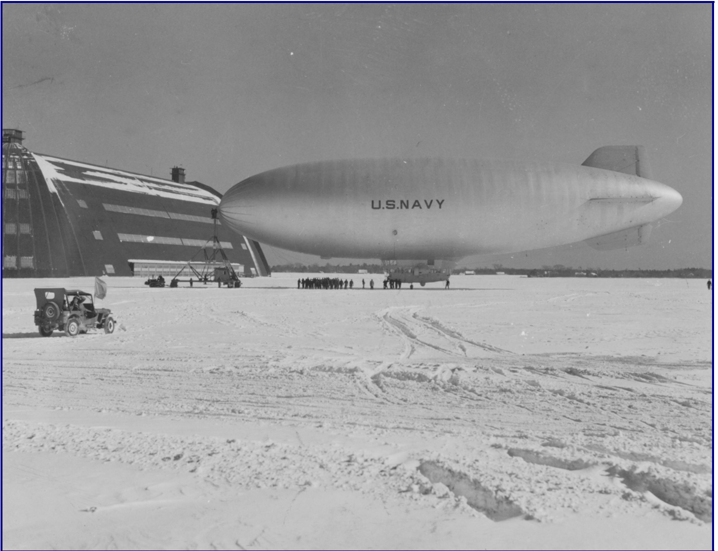
ZP-11 ZNP-K type blimp K-11 secured to a mobile mooring mast and being ground handled on the snow-covered airfield in front of LTA Hangar One at NAS South Weymouth during February 1944. Airship Patrol Squadron 11 flew Goodyear ZNP-K type blimps such as this on operational ASW patrol and convoy escort missions out of NAS South Weymouth from June 1942 to May 1945.